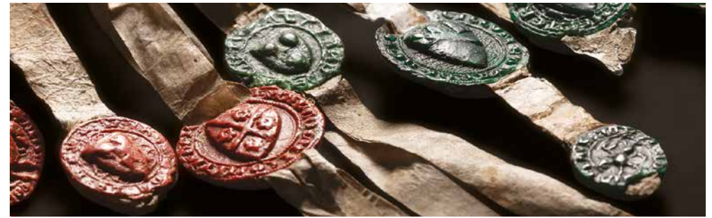
Left, right: Initial letter and seals of the Declaration of Arbroath

A papal attempt to secure peace failed when King Robert recaptured the border town of Berwick in 1318. The Pope issued letters in November 1319 summoning the King and four Scottish bishops to attend the papal court. Their refusal to obey the summons led to their excommunication. The Declaration was part of their diplomatic counter-offensive.